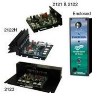
Fincor 2120 Series