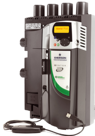
DC Drives to 5,000 hp