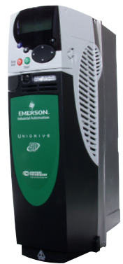
AC Drives to 2,900 hp