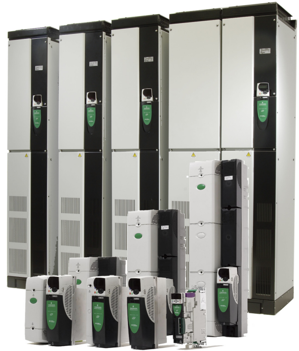
AC Drives & Engineered Systems to 2,900 hp

Control Techniques can evaluate your application and help you decide which drive solution is best for your situation. We have significant web handling experience and can provide stand-alone AC or DC drives, enclosed drives, and systems including hardware and / or software engineering.